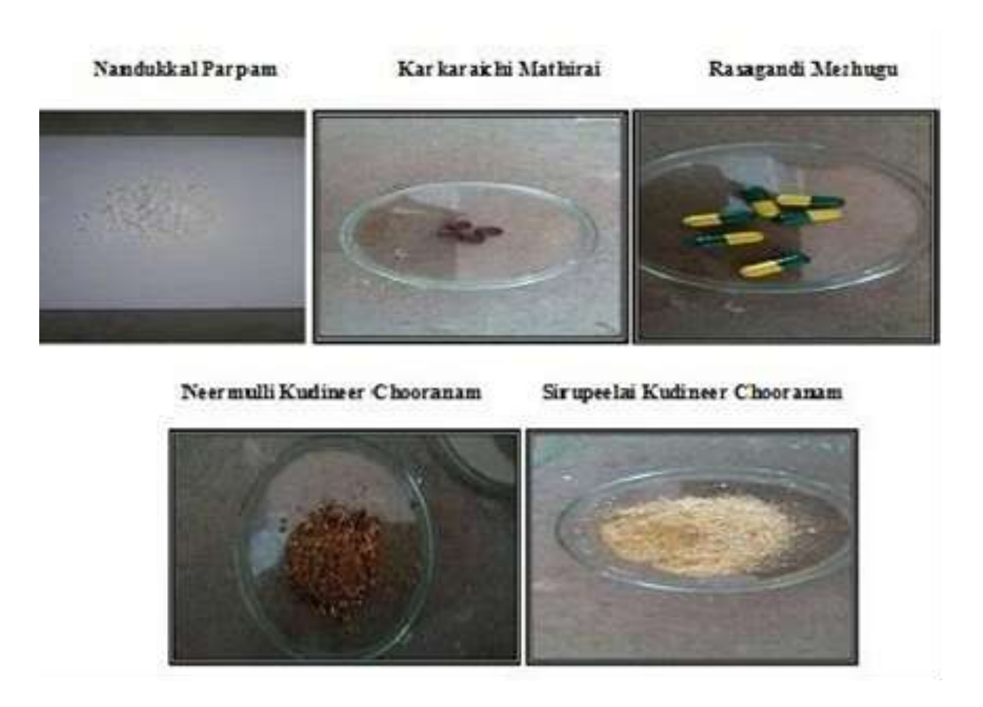
Figure 1. Dosage forms of chosen Siddha Formulations