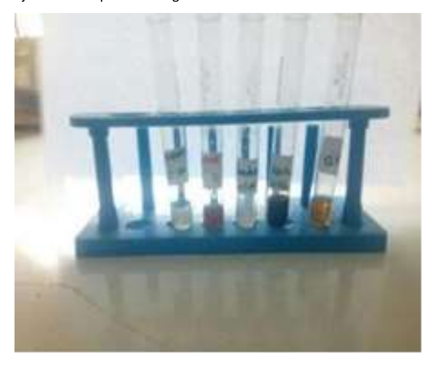
Figure 2. Ethanol extracts of the Siddha formulations

Authenticated drugs were procured from a GMP certified Siddha drug Manufacturing company. Ethanol extraction of the siddha formulations were prepared by adding 1gm of the drug in 10ml of ethanol to obtain a 10% concentration of the medicine. Similarly 20% concentration of the extract was also prepared. The solution was subjected to frequent shaking and filtered after 24 hours to obtain the extract. (Figure. 2)