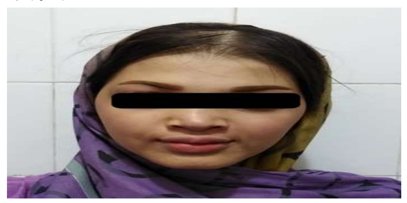
Figure 1. Extraoral view of patient

Clinical examination showed decreased hair growth and thinning hair, scanty eyebrows, thick and prominent lips, protrusion of the forehead, sunken nasal bridge (saddle nose), and decreased midface depth (Figure 1).