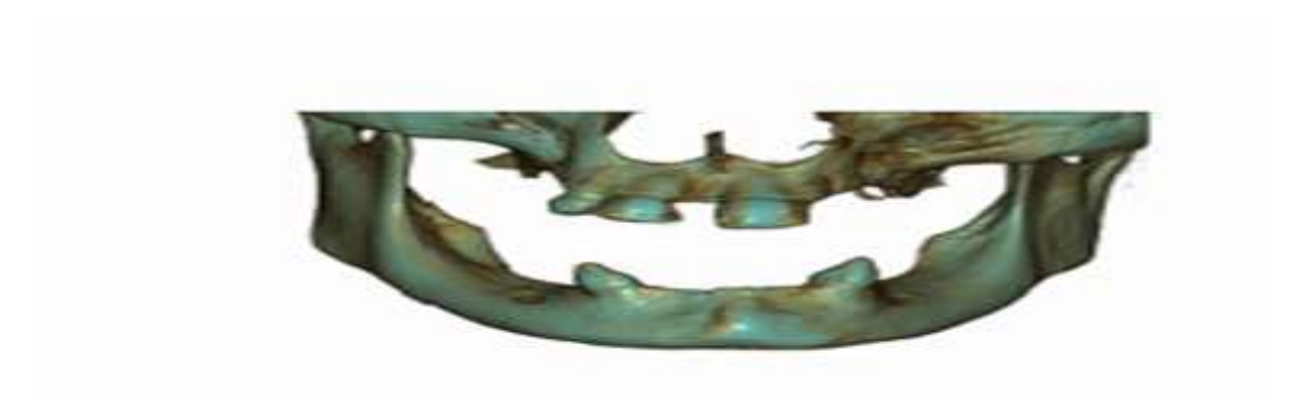
Figure 5.Three-dimensional CBCT image