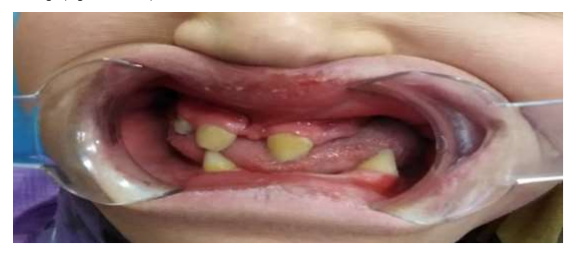
Figure 2. Intraoral view of the patient

The patient suffered from dry skin and reduced ability to sweat (hypohidrosis). There was no abnormality in the nails and fingers and toes (ectrodactyly). The intelligence quotient (IQ) of the patient was at the normal level. The cone beam 3D reformatted images showed that the patient had a total of 5 teeth (three right maxillary central and lateral incisors and two mandibular anterior teeth) and a retained root within the jawbone and 27 missing permanent teeth. The teeth were cone-shaped, pointy, and smaller than the average (Figure 2 and 3).