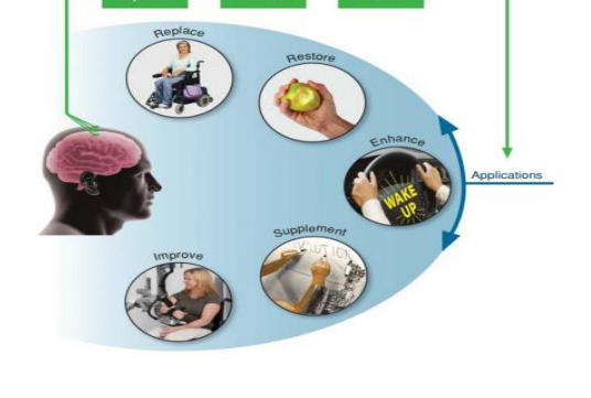
Figure 1. BCI system design and operation.[5]

The function of the central nervous system (CNS) is to receive inputs from the surrounding of the human bodyand producing outputs that serve the requirements of it. Brain Computer Interface (BCI)is a computerized device, that captures electrical signals of brain and transfigure into various outputs that improve natural CNS output[5]. The main purpose of BCI is to create useful functions for physically challenged people affected by neuromuscular disorders. Human BCI ismainly categorized as Semi-Invasive,Invasive,andNon-Invasive[36][35]. In Invasivetype, microelectrodes are placed directly into the outer cortex of the brain. In semi-Invasive BCI type, the electrodesare partially placedin the brain but rest outside the skull. In Non-Invasive type,the Electrodes are implanted outside the skull.Various Techniques are used in BCIareECoG,MEG, fNIR,MRI,SPECT, fMRI, EEG[6].