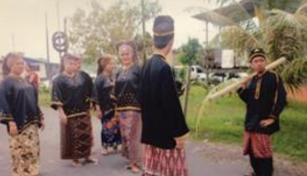
Figure 3Tekulok and Sikong worn on special occasions and performance