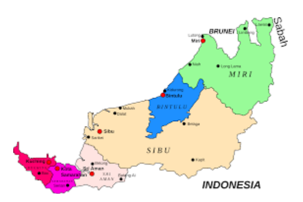
Figure 1 Map of Sarawak