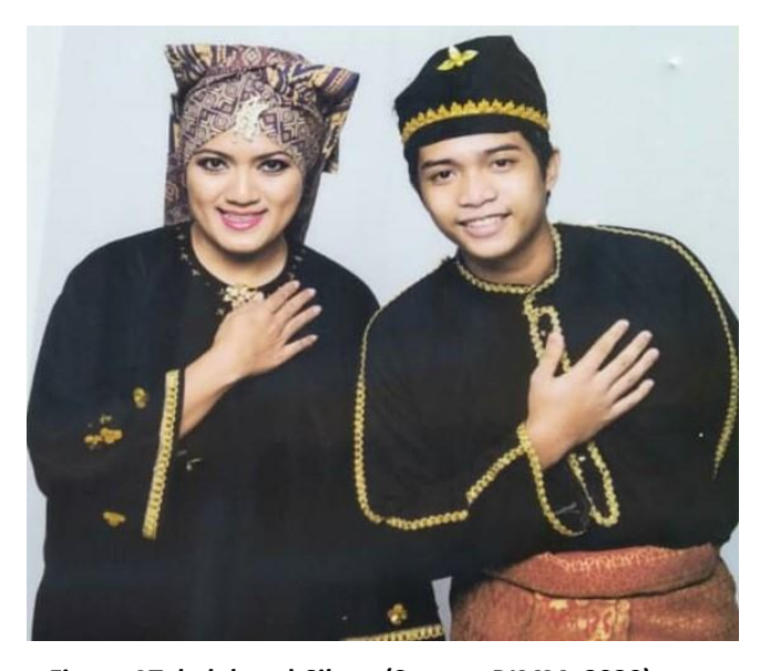
Figure 4Tekulok and Sikong

Figure 4 shows tekulok and sikong wearing styles. The tekulok is made of black velvet fabric and adorned with yellow lace. As for a sikong can beeithera batik sarung or songket , which also has a black and yellow pattern or motif.