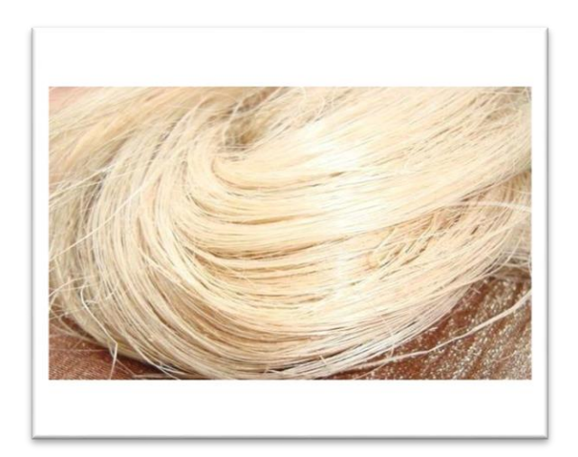
Fig.1 Banana Fibre