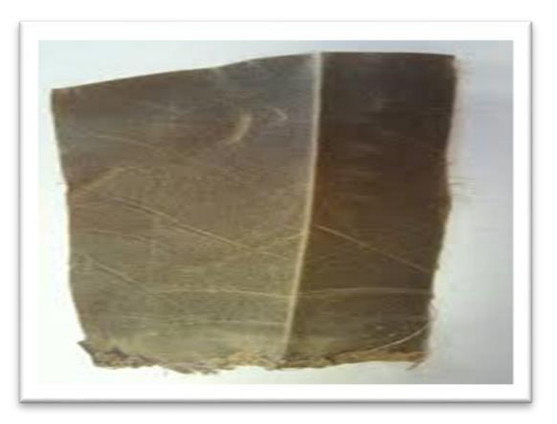
Fig. 3 Oil

Oil cloth is also known as enamelled cloth or American cloth. It is a linen cloth with a coating of boiled linseed oil to make it waterproof.