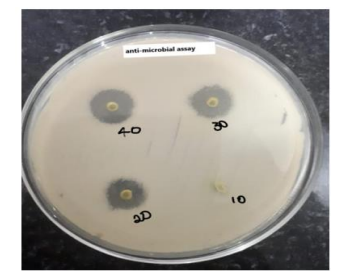
Figure 3: Anti-microbial test

Anti-microbial test: This test effectively confirms the anti-microbial activity of essential oil of Artabotrys hexapetalus flower. The zone of inhibition was visualized from an incubated plate <sup>14</sup>. The anti-microbial activity of this EO is due to the presence of many chemical groups namely \beta -caryophyllene, caryophyllene oxide, ylanga-2,4(15)-diene etc. According to the research of Giang M. Phan et al. , the essential of this Artabotrys hexapetalus flower contains totally twenty-six compounds which includes sesquiterpene hydrocarbons (33.3 % of EO) and oxygenated sesquiterpenoids (47.7 %).