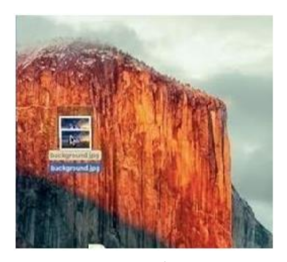
Fig 3:Fig: Desktop view of clicking operation Fig 3 states the clicking operation of the file in desktop view.