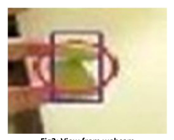
Fig2: View from webcam Figure 2 states the view of the file using webcam.