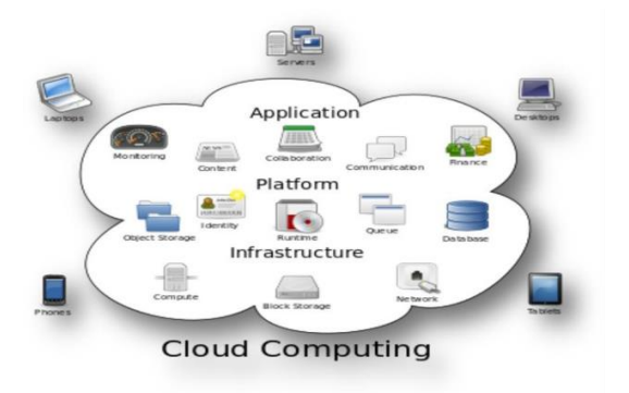
Fig 1.1: Cloud Computing Overview

consists of hardware and software resources made available on the Internet as managed third-party services. These services typically provide access to advanced software applications and high-end networks of server computers.