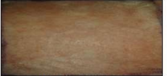
FIG.3: CONTROL (24HRS)