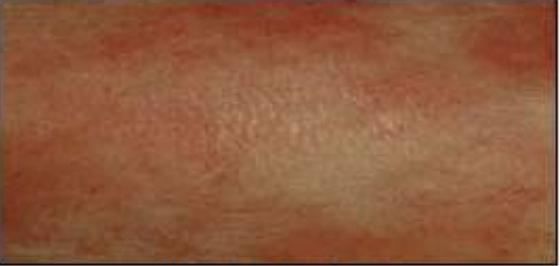
FIG. 4: TEST (24HRS)