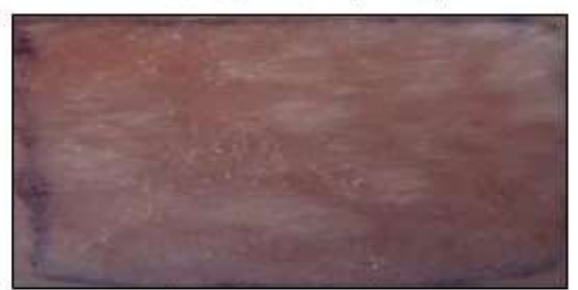
FIG. 5: CONTROL (48HRS)